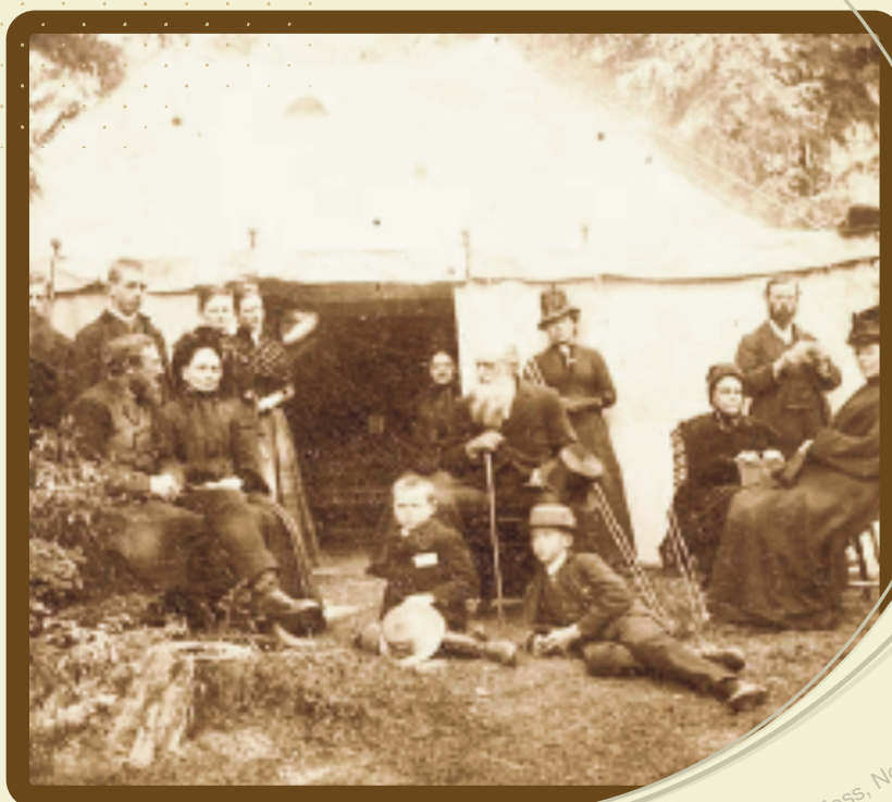
E.G. White sitting 3rd from the right at a camp meeting in Moss, Norway (June 1887)

A COURSE IN CHURCH HISTORY HIGHLIGHTING SIGNIFICANT DETAILS OF INTEREST TO THE YOUTH OF THE SEVENTH-DAY ADVENTIST CHURCH